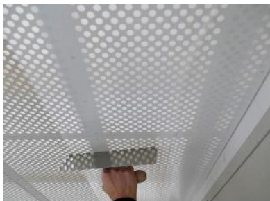
Apply the dots, press down firmly with smoothing trowel

Heating the surface with the adhesive dots is recommended to facilitate release of the dots from the carrier foil. The Cleaneo SYSTEXX Dots must be applied over the entire surface.