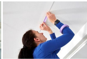
Cleaneo SYSTEXX Silent overlap area

Please do not use standard wallpapering tools to hang the material! The risk of damaging the surface is very high.