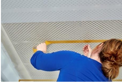
Application of silicone tape