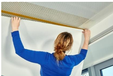
Align Cleaneo SYSTEXX Silent to the silicone tape.

Use a soft wallpaper brush or soft roller to apply the wall covering and press the drops firmly and evenly onto the substrate. Align the drops to the Cleaneo SYSTEXX Tape. Make sure to place the first few meters of the wall covering exactly along the edge of the tape. We recommend working in a team of two.