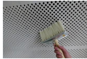
Priming of Cleaneo SYSTEXX Acoustic Board

The finished construction clad with perforated panels must be coated with an aqueous penetrating primer. Priming must be carried out with a brush (do not use a roller!)