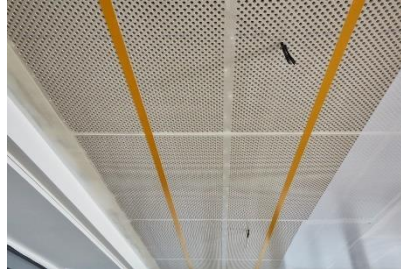
Non-perforated strips covered, every other strip must be masked with tape