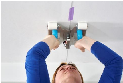
Double cutting with Cleaneo SYSTEXX Tool

The Cleaneo SYSTEXX Tool is a special knife developed for the Cleaneo SYSTEXX system. It facilitates double cutting without damaging the substrate (Cleaneo SYSTEXX Board/Panel) causing the panels or boards to crack.