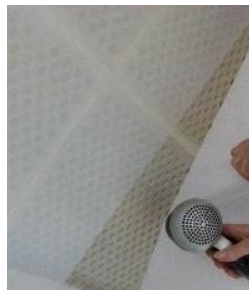
Heat with hair dryer