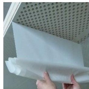
Peel off the carrier foil at a 90 degree angle